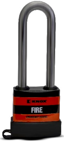
EXTERIOR USE Model #3781