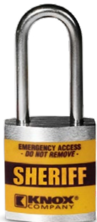
INTERIOR USE Model #3771