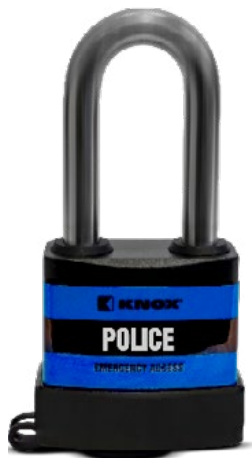
EXTERIOR USE Model #3782