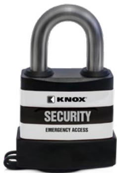
EXTERIOR USE Model #3783