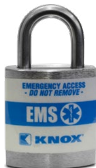
INTERIOR USE Model #3774