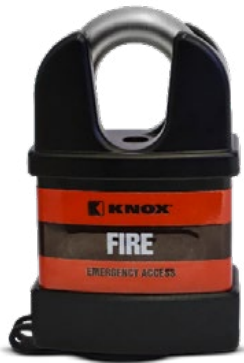
EXTERIOR USE Model #3784